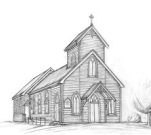
ST JOHN THE BAPTIST 244 PARNELL ROAD PARNELL, AUCKLAND