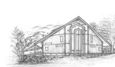
ST PETER'S ONEROA WAIHEKE ISLAND