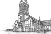
CATHEDRAL OF ST PATRICK & ST JOSEPH 43 WYNDHAM ST, AUCKLAND