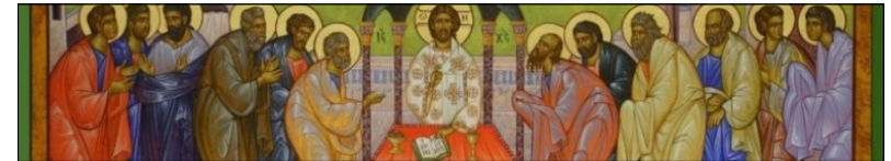
TABLE OF PLenty